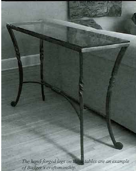
The hand-forged legs on these tables are an example of Badger's craftsmanship.

Written by CYNTHIA OATES • Photography by BOB EPSTEIN